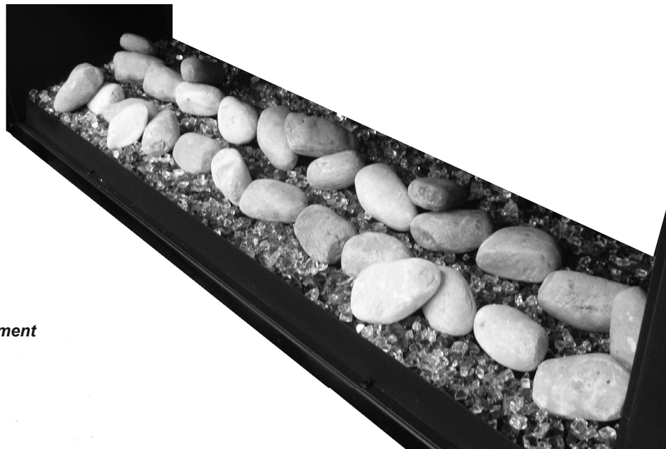
Figure 39 - Stone Placement